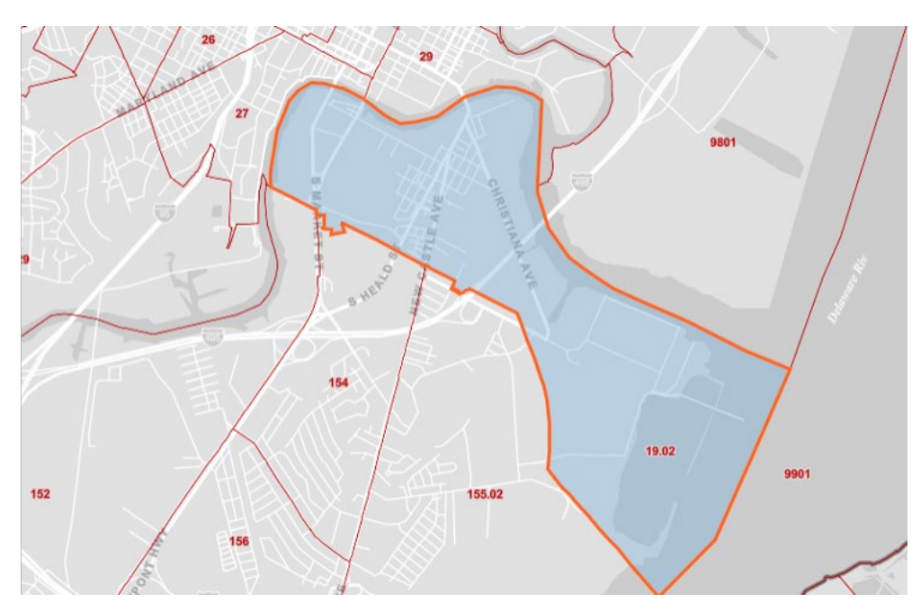
Figure 2. Core Community of Southbridge by Blocks