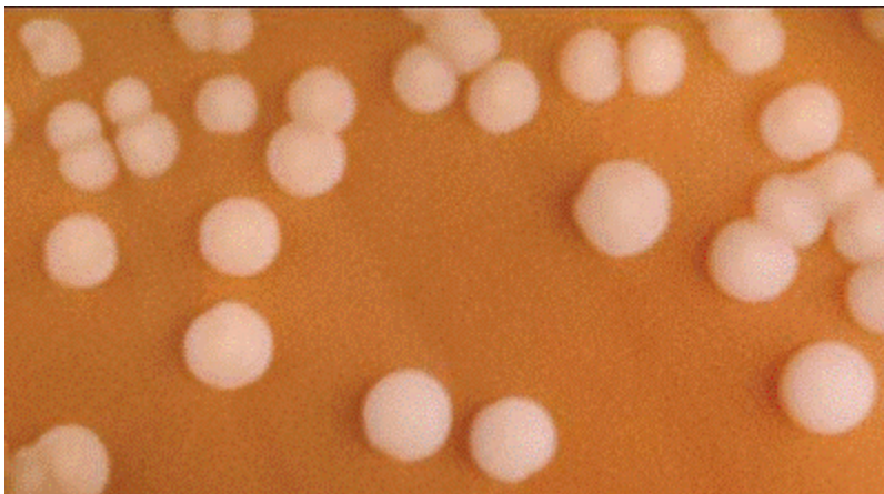
Figure 1: N. meningitidis colonies on a chocolate agar plate 1

In the United States, meningitis is the most common clinical presentation of invasive meningococcal disease, occurring in about 50% of cases; other presentations include bacteremia