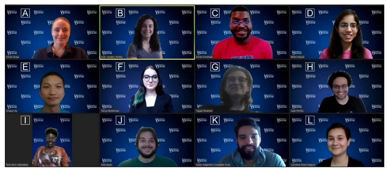
Figure 3. Members of the Perilla/Hadden-Perilla research team.

Our research laboratories actively seek to attract diverse individuals to the field of computational structural virology. Notably, our team (Figure 3) is currently 50% male and 50% female, made up of domestic and international scholars, and includes members who identify as White, Black, Asian, Hispanic or Latino, LGTBQ, disabled, first-generation college student, first-generation immigrant, and Delaware native. Figure 3 shows a picture of our team during a recent video conference meeting. To support social distancing on the University of Delaware campus, the team has been working remotely since March 2020.