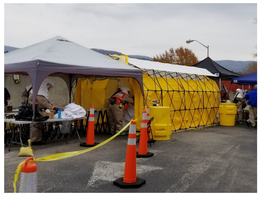
Figure 2. Hospital Decontamination Zone. In a mass-casualty chemical incident, a decontamination corridor of often used to rapidly clean and move patients through the hospital decontamination zone. Photo by Gregory Wanner, at Hospital Emergency Response Training in Anniston, AL.

Regarding personal protective equipment (PPE), hazardous materials responders at the scene ("hot zone") of an unknown type of chemical release are often outfitted in Level A (fully encapsulating suit with self-contained breathing apparatus [SCBA]) or Level B (chemical resistant suit with SCBA) equipment.<sup>11,31–33</sup> This high level of respiratory protection, however, is not necessary for hospital-based first-receivers working in the potentially contaminated "hospital decontamination zone" away from the site of a release.<sup>1,11</sup> A time lapse of at least 10 minutes between a patient's exposure and hospital arrival allows for "substantial levels of gases and vapors from volatile substances to dissipate."<sup>1,18</sup> For this reason, Level C PPE, consisting of an air-purifying respirator (APR) or powered air-purifying respirator (PAPR) with appropriate filter cartridge, and a chemical-resistant suit with two layers of chemical resistant gloves, are recommended for first-receivers in a hospital decontamination zone (see Figure 3). Level D PPE (work uniform and everyday PPE) may be used for non-hazardous "nuisance" contamination or in handling clean patients after decontamination in the uncontaminated "post-decontamination zone."<sup>1,11,31–33</sup>