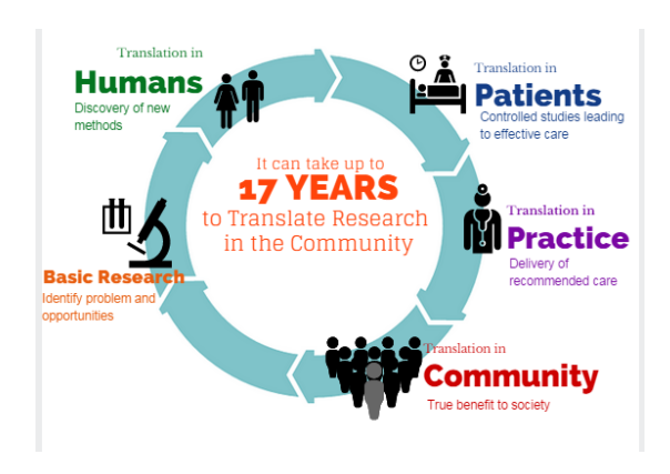
Figure 1. Community Engaged Research requires many stakeholders to work together (figure compliments of ACCEL).

inequity. In the academic world of "publish or perish," a researcher may prioritize publication yet publication is rarely a route to meaningful dissemination and impact in the community. In CEnR, academics and communities collaborate and share a priority- to have a meaningful improvement of health (see Figure 1).